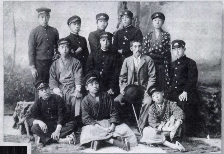
With his students of Fukushima Middle School (present day High School)

His life as a bridge between Japan & America